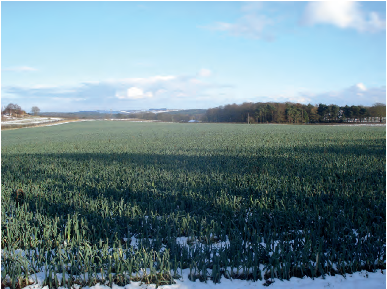
Photograph D for Question 6